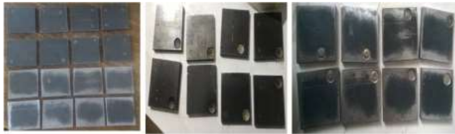
Figure 1: Samples before and after machining with both the tools

A two level full factorial design of experiments is adopted for calculating the main and the interaction effects of the three factors at two levels ( 2^3 = 8 ) experiments are conducted to fit an equation. The experiments are done for both the tools and the equation is written. After the experimentation, the MRR values are calculated.